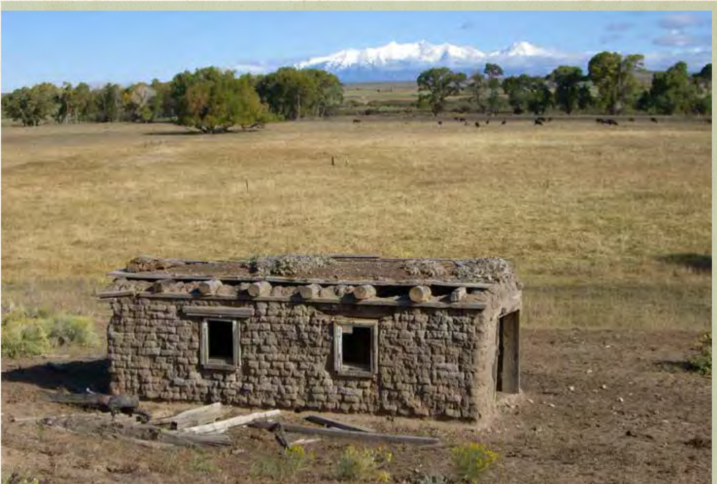
Adobe and Blanca Peak