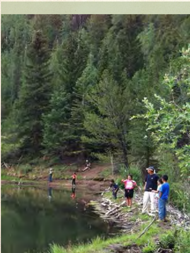
Fishing the beaver ponds in Batenburg Meadows

The Costilla County Trails, Recreation, and Open Space Master Plan is the result of hard work from federal, state, and local organizations as well as thoughtful suggestions from county residents. We hope you find this document useful and inspiring to get out into your community and enjoy the outdoors and protect significant resources.