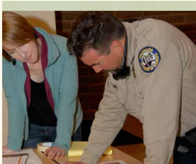
Community knowledge of resources and potential trail connections was important to the master planning process

In January 2011, the County seized the opportunity and began developing a comprehensive plan that addresses the above mentioned needs by engaging county residents and partners in developing, connecting, and promoting county resources. Currently, the county has resources available that were not available previously including the recently designated Sangre de Cristo National Heritage Area, planning and technical assistance from the National Park Service’s Rivers, Trails, and Conservation Assistance Program, commitment from both statewide and local conservation organizations (Colorado Open Lands and the Rio Grande Headwaters Land Trust), AND a grant from Great Outdoors Colorado. The county is fortunate to have